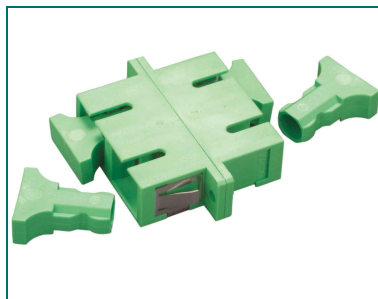
SCA SINGLEMODE DUPLEX