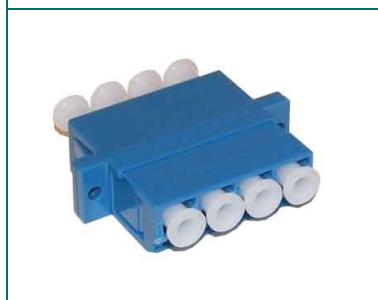
LC QUAD SINGLEMODE