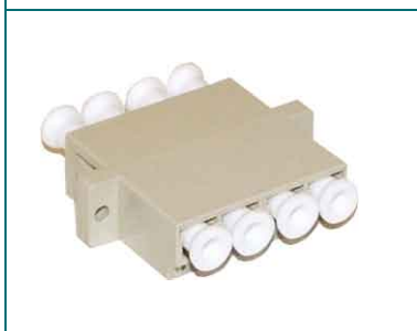
LC QUAD MULTIMODE