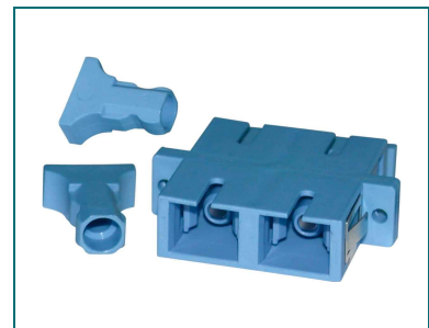
SC SINGLEMODE DUPLEX