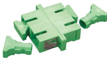
SCA SINGLEMODE DUPLEX