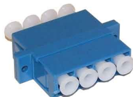
LC QUAD SINGLEMODE