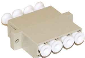
LC QUAD MULTIMODE